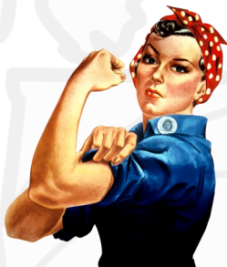
Ladies can be woodworkers too!

The group meets on Fridays from 10:00am—2:00pm. If you are interested in joining or want more information you can contact Terri Hjetland @ 270.705.7661 or feel free to stop by to visit on Friday.