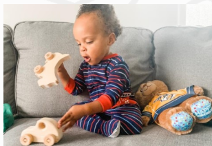
“Happy Toy Day”

We will resume on Tuesday, January 7, 2020