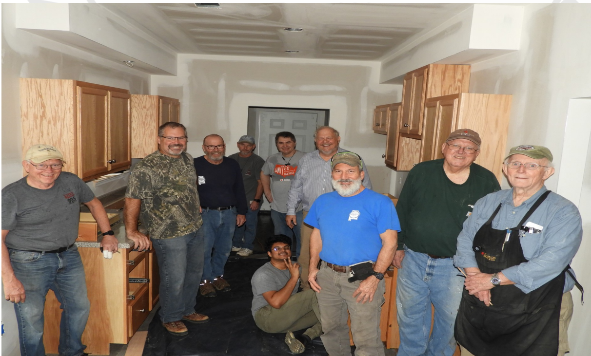
The pride of AWG